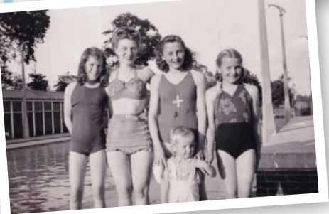
Re-opening party 1985 >>