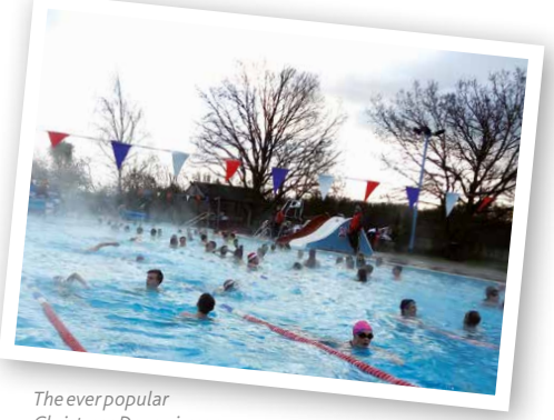
Christmas Day swims >>