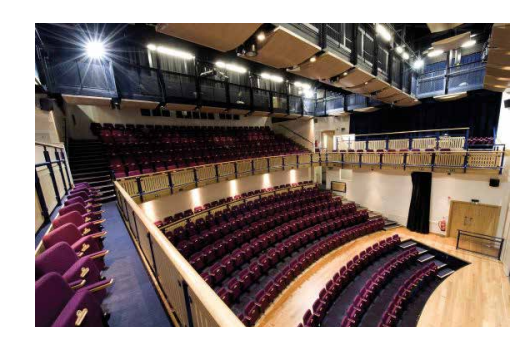
The Hammond Theatre is situated in the grounds of Hampton School, Hanworth Road, Hampton, TW12 3HD.

Access is via the main gate of Hampton School.