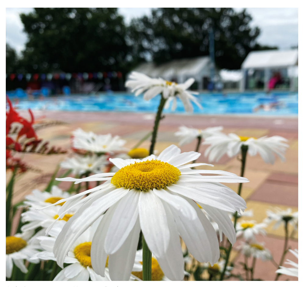
A glorious summer at Hampton Pool

Following the roller coaster of news about the pandemic in recent months, it's lovely to see so many people returning to swim and exercise at Hampton Pool. We are still hoping for a long hot summer and early autumn to make up for the poor spring!