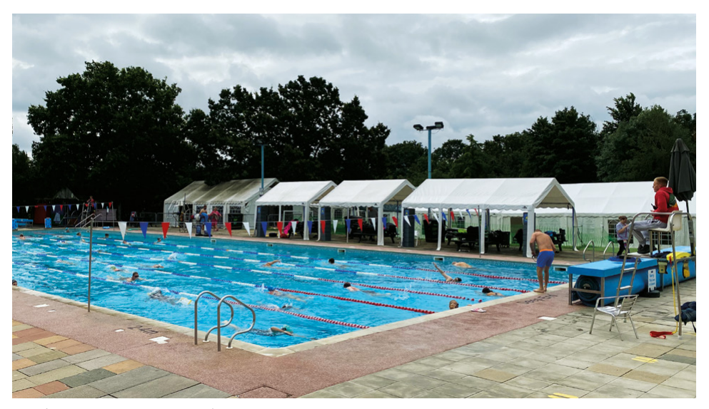
Inside-out at Hampton Pool

We are at a pivotal point in our history, reflecting on the role of the Pool from the 1920s to the present and looking forward as we plan the redevelopment of our community pool for the next 100 years! The unanimous approval of our plans by Richmond and Wandsworth Planning Committee in November 2020 was reported in our winter issue; this issue includes an update on more recent developments and how we will communicate with our neighbours and stakeholders. •