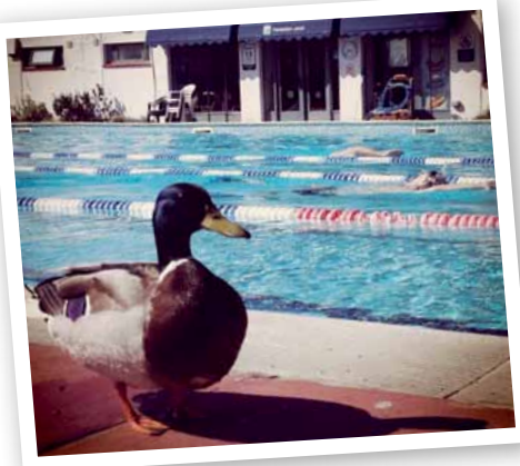
One of our three regular new 'unofficial' club members on his daily promenade around the pool.

We started our 2012 season at the beginning of April and are pleased to see old friends and to welcome a number of new members – individual swimmers, couples and families.